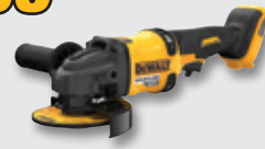
DCG418B 60V MAX* Brushless Cordless 4-1/2 in. - 6 in. Grinder with KICKBACK BRAKE™ (Tool Only)