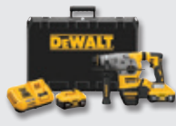
DCH293R2 20V MAX* XR® Brushless Cordless 1-1/8 in. SDS PLUS L-Shape Rotary Hammer Kit