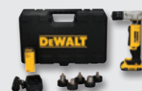
DCE450D1 20V MAX* Copper Swage Tool Kit