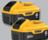
$179 DCB206-2 20V MAX* 6Ah Battery (2 PK)