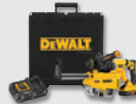
DCH263R2DH 20V MAX* XR® Brushless 1-1/8 in. SDS Plus D-Handle Rotary Hammer Kit