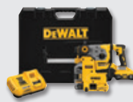
DCH293R2DH 20V MAX* XR® Brushless Cordless 1-1/8 in. L-Shape SDS PLUS Rotary Hammer Kit with On Board Extractor