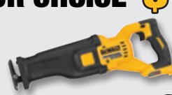
DCS389B 60V MAX* Brushless Cordless Reciprocating Saw (Tool Only)