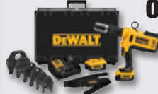
DCE200M2K 20V MAX* Cordless Press Tool with Jaws