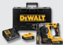
DCH273P2 20V MAX* XR® Brushless Cordless 1 in. SDS PLUS L-Shape Rotary Hammer Kit