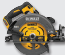
DCS578B 60V MAX* Brushless Cordless 7-1/4 in. Circular Saw with Electronic Brake (Tool Only)

OR DCK2050M2 20V MAX* XR® Hammer Drill and ATOMIC Impact Driver 2 Tool Cordless Combo Kit