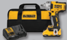
$249 DCF891Q1 20V MAX* XR® 1/2 in. Mid-Range Impact Wrench Kit with Hog Ring Anvil