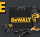
DCE155D1 20V MAX* Cordless ACSR Cable Cutting Tool Kit