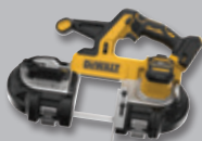
$249 DCS378B 20V MAX* XR® Mid-Size Bandsaw (Tool Only)