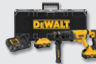
DCH263R2 20V MAX* 1-1/8 in. Brushless Cordless SDS PLUS D-Handle Rotary Hammer Kit