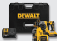
DCH273P2DHO 20V MAX* XR® L-Shape 1 in. SDS Plus Rotary Hammer Kit with Onboard Dust Extractor