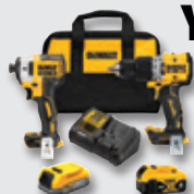
DCK249E1M1 20V MAX* XR® Cordless Hammer Drill Driver and Impact Drive Combo Kit