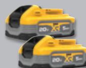
$229 DCBP520-2 20V MAX* XR POWERSTACK™ 5Ah Battery (2 PK)